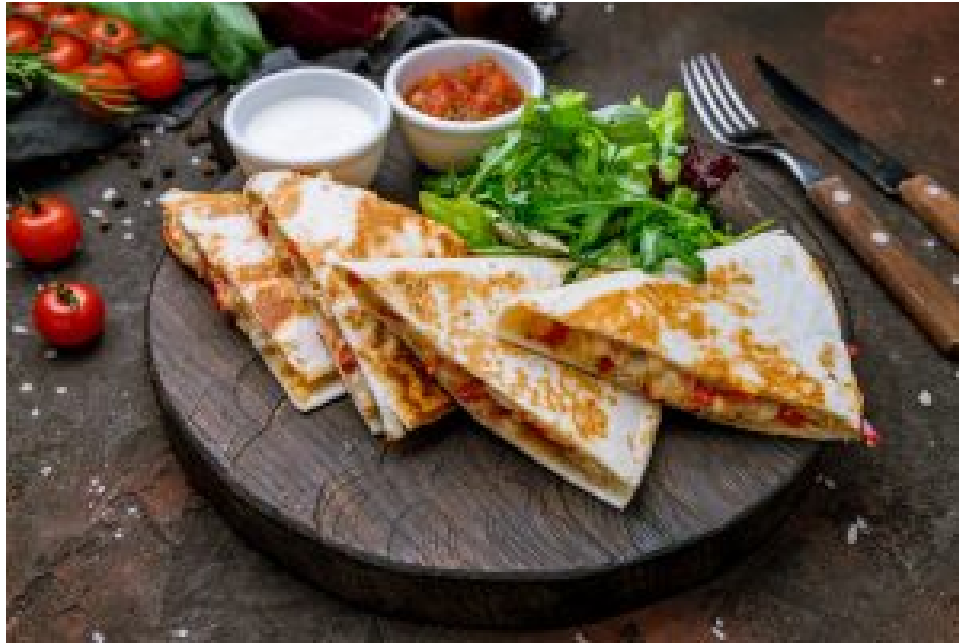
Low Carb Foldover Quesadillas