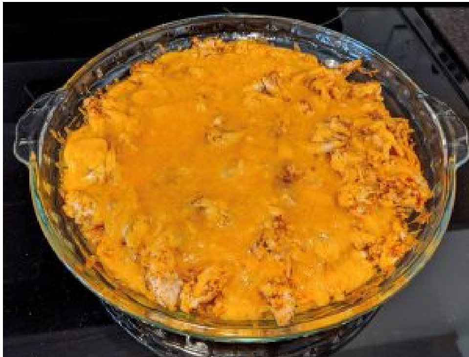
Upside Down Tamale Pie