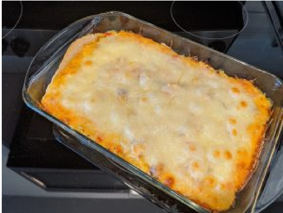
Chicken Enchilada Suizas Casserole